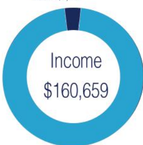
Grants and Contracts 95.4% - $153,224

Energy Wise Alliance runs high-impact, low-cost programs to make a difference in the lives of local families. For example, at our summer camp program, 400 students learned self advocacy, and made contact with local decision makers in energy, water, public safety and sustainable development to advocate for their own interests. All at a total program cost of about $20 per student who each received over 4 hours instruction in energy efficiency, home science, self-advocacy and climate science.