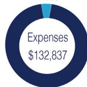
Program Expenses 94.3% - $125,249

“ Great opportunity for teens to dig deep to observe problems and work together to find solutions to our energy crisis!